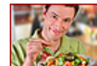
Restaurant / Cafe